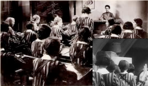
DOROTHEA WIEG EN HERTHA THIELE IN „JA“ DOROTHEA WIEG ET HERTHA THIELE DANS "JEUNESSE"